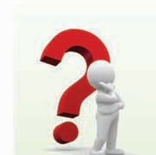
Page 2 - Why choose PureCo