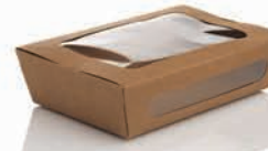
Window Box 2 32oz/1000ml 200 pcs/ctn