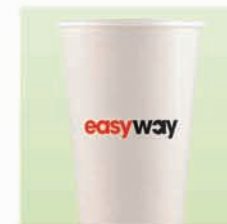
Page 5 - Easyway