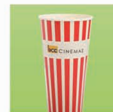
Page 11 - Cold Cups