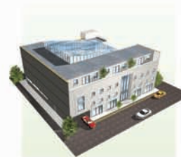
Page 1 - About the Factory