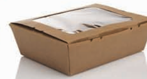
Window Box 3 50oz/1500ml 200 pcs/ctn