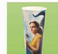
Page 12 - Custom Product