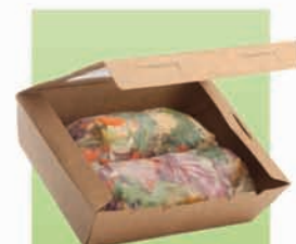
Page 9 - Lunch Boxes