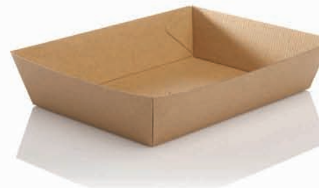
Food Tray (1) 130*91*50 500 pcs/ctn