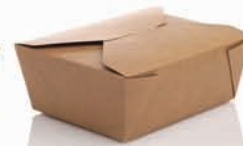
Lunch Box 2 32oz/1000ml 200 pcs/ctn