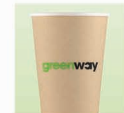
Page 6 - Greenway