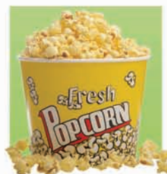
Page 10 - Popcorn Packaging