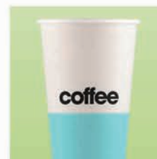
Page 7 - Coffee Cups