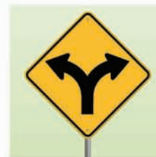
Page 4 - Pick a Path