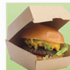
Page 8 - Food Boxes & Trays