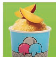
Page 13 - Other