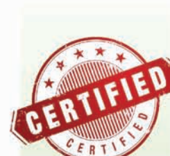
Page 3 - Certification