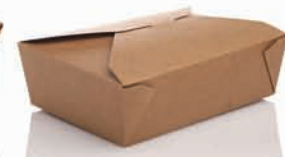
Lunch Box 4 80oz/2400ml 200 pcs/ctn